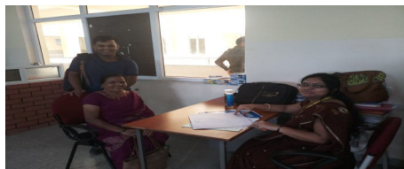
Parents Meet up with Proctors