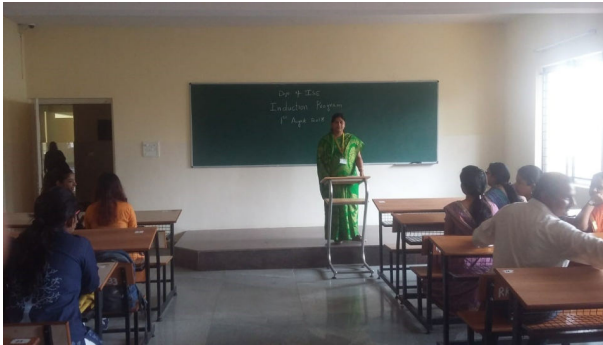
Started the Semester with Orientation Program