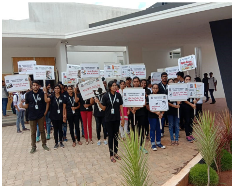
ISE Students in NSS Activities