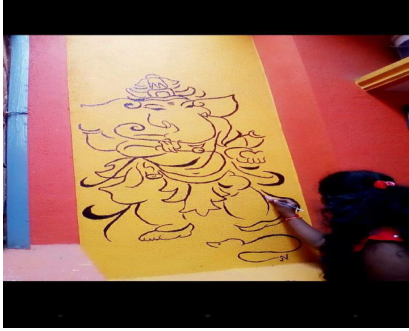
Wall ART By Niveda Ramesh 5th sem