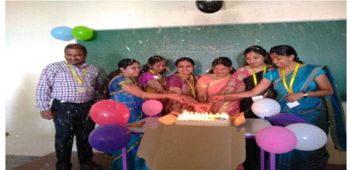
Teacher's Day Celebrations on Sept 5th 2018