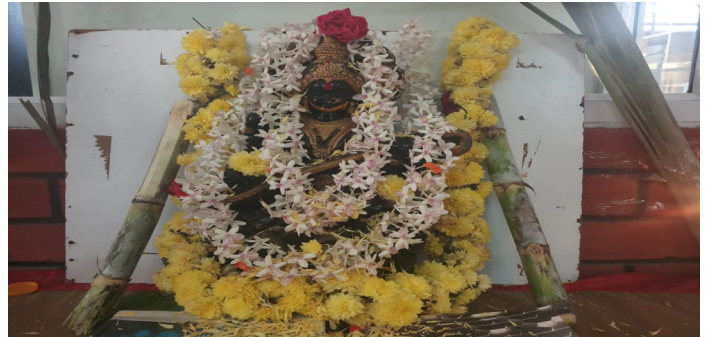
Goddesses Saraswathi Pooja on Ayudha Pooja Day